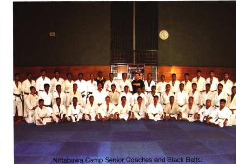
Nittabuwa Camp Senior Coaches and Black Belts.