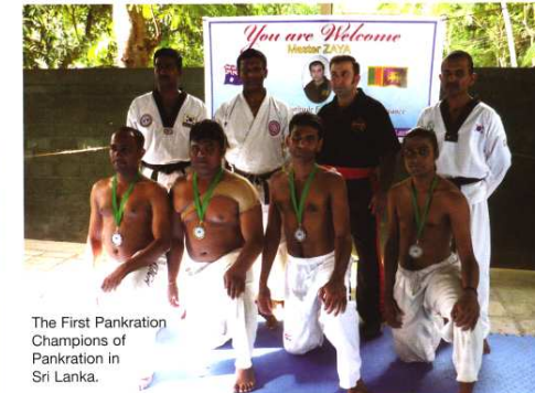
The First Pankration Champions of Pankration in Sri Lanka.